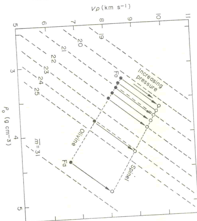
FIG. 5(a). Compressional wave velocity-density-mean atomic weight relation for olivine. The contours of \bar{m} are drawn from Birch's law. The closed circles represent experimental quantities and the open circles show estimated values for the olivine-transformed spinels.